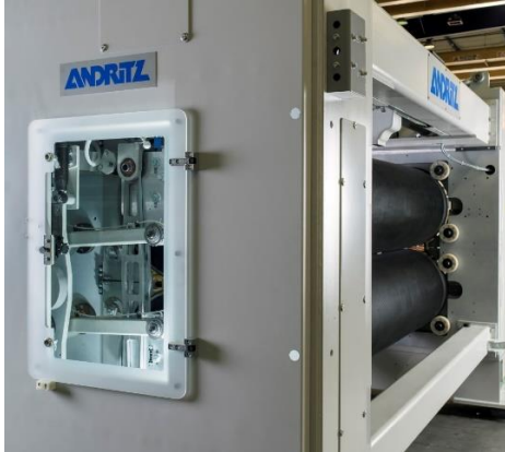
Elliptical cylinder pre-needler during assembly (Elbeuf workshop)