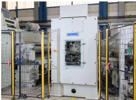
PA.3000 elliptical cylinder pre-needler at the Elbeuf Technical Center