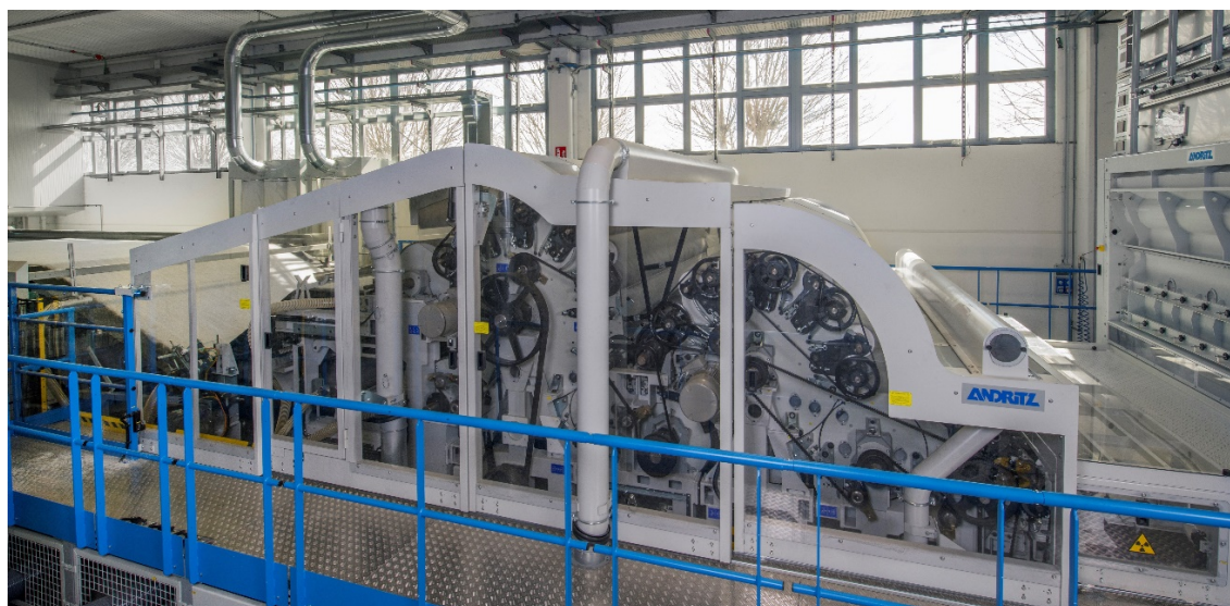
ANDRITZ eXcelle card in operation