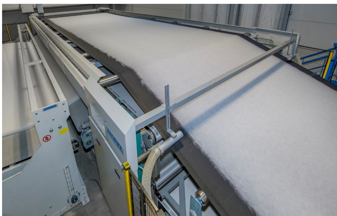
ANDRITZ eXcelle crosslapper